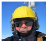
Leak Locators of Monta... Leak Locators of Montana LLC

406-223-2500 Mobile leaklocatorsofmontana@gma... 424 Buckskin RD Belgrade, Montana 59714 125 N Washington ST Plentywood, Montana 59254 leaklocatorsofmontana.com